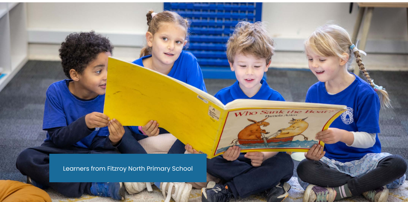
Learners from Fitzroy North Primary School

Please note: declaring an impairment and / or a conduct matter will not automatically result in rejection of your application. The VIT may ask you to provide further information in order to assess your suitability to teach.